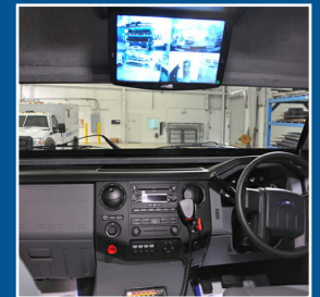
In-cab CCTV that will cover rear of cab and the passenger for additional security (soon to be legislation)

"With thousands of taxis already using All Communications connectivity in their cabs we have a trusted solution at a cost that will in most cases be lower than your existing service."