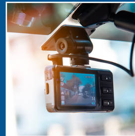
Forward-facing CCTV to cover your cab and your driver in the case of an accident